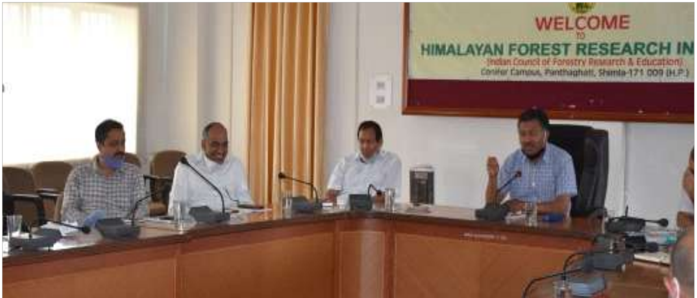
Seminar on Role of Honey Bees as Pollinator in Forest Ecosystem and Impact of Anthropogenic activities on their population in the North Western Himalaya