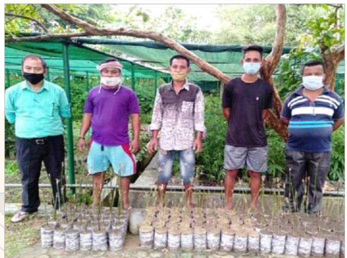
Skill Development Training on Bamboo Nursery Management and distribution of certificates at RFRI