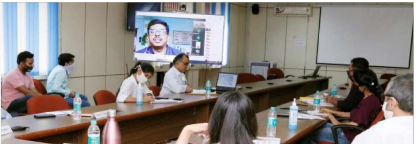
Webinar on Natural Dyes from Forest Biomass