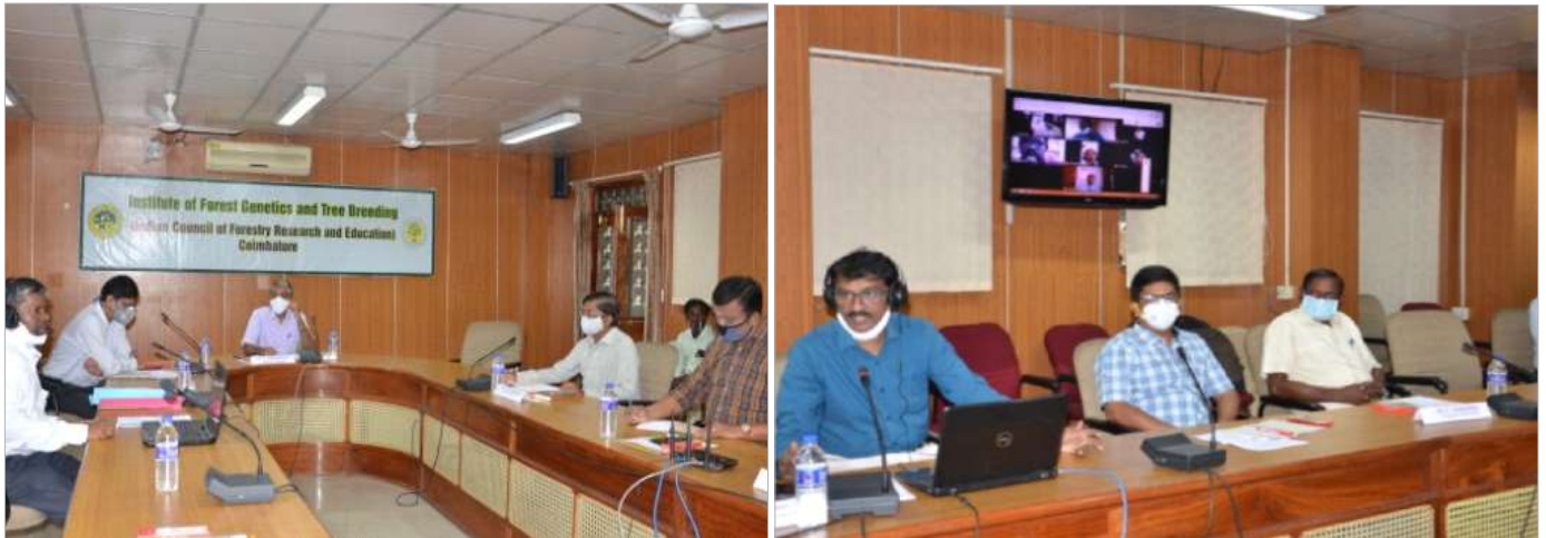
Webinar on Conservation and Utilization of Cinchona in the present COVID-19 Situation