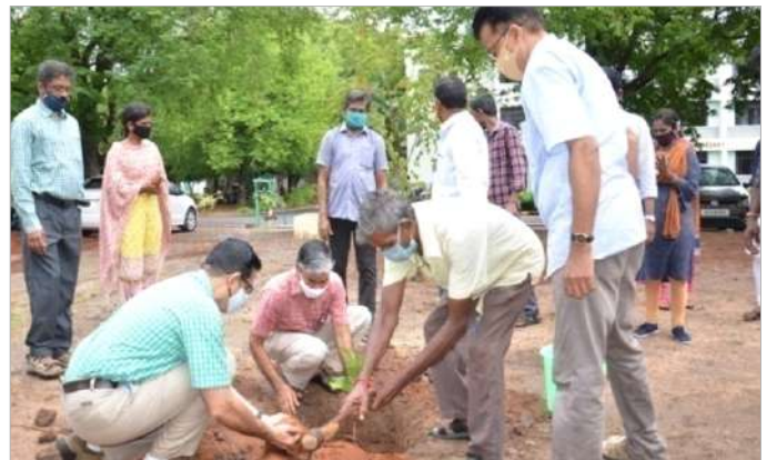
International Day for the Conservation of the Mangrove Ecosystem celebrated at IFGTB, Coimbatore