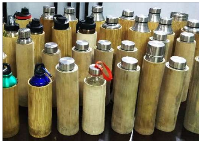
Training on Bamboo Craft Work for Hand Made Water Bottles at Agartala