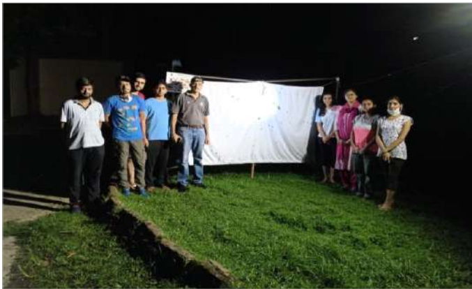
Moths being observed at FRI campus during Moth week